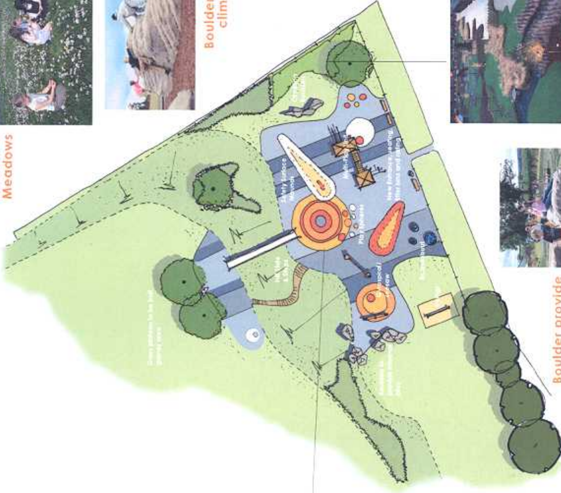
Boulder provide informal play