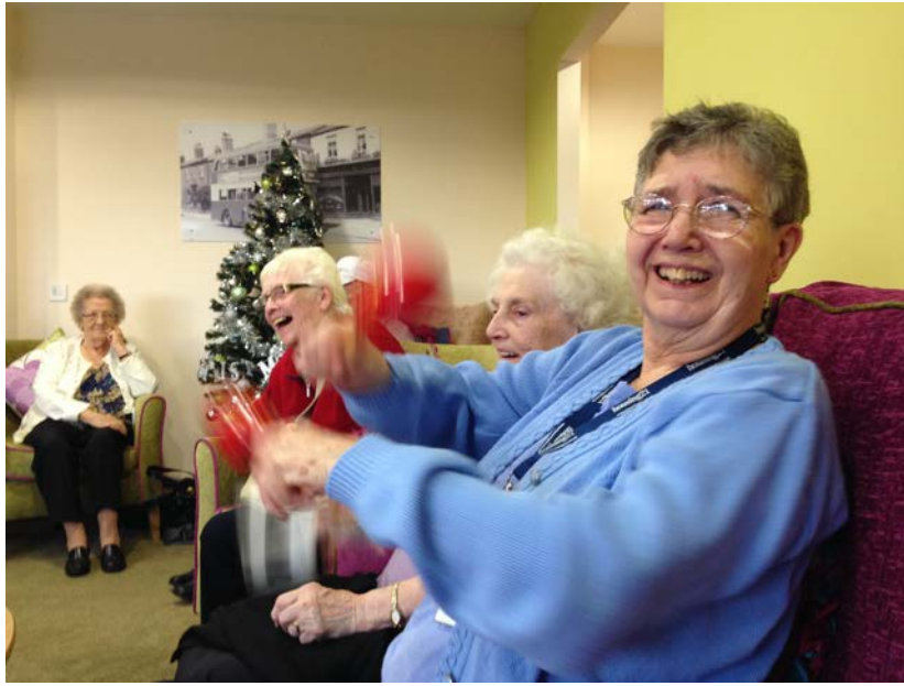
Seafarers Way: Music Workshops

We are continuing to work closely with, and support, the East Area Voluntary and Community Sector (VCS) Network. VCS organisations have been integral in supporting the Area Committee to achieve what it has during 2014 / 15 and relationships will continue to strengthen in the future as opportunities arise for our communities to become more self sufficient and resilient. We're committed to improving on the successes we have seen this year and will continue to keep local communities at the heart of everything we do. We will continue to develop our relationships with partners and identify future priorities together to ensure local services are joined up and that we are supporting local communities to take an active role in shaping services to meet local need. Area Committee members in their role as community leaders will continue to be best placed to work with local communities in collaboration with our partner organisations.