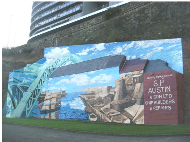
Panns Banks: Celebrating our river corridor

A mural entitled the history of the river corridor has been painted at Panns Bank. It is designed to reflect the heritage of the river wear and it is a riverside highlight of the newly opened section of the England Coast Path, a new national trail improving access to the coast. The committee have allocated funding to provide signage and art work along the route of the path that interprets stories and information about the coastline and Hendon and Ryhope communities.