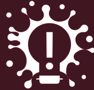
A vibrant smart North