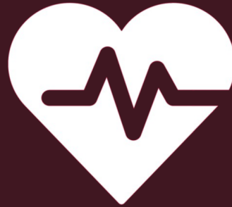
A healthy smart North