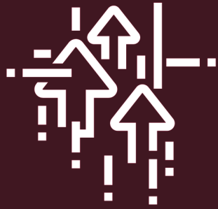
A dynamic smart North