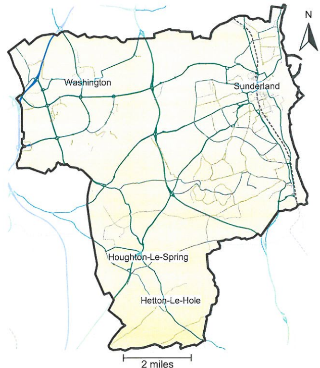
Contains OS data © Crown copyright and database rights 2015 OpenStreetMap contributors ODbL