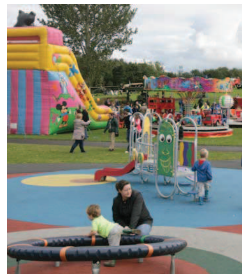
Washington Heritage Festival

The year ahead - Washington Area Committee will continue to work in partnership to deliver local benefits for local people. The next year will see a further focus on ensuring opportunities for employment for local people, improving health outcomes including looking at the provision of mental health services for young people and delivering a dementia awareness health champions course, and supporting the VCS to develop and deliver services for local people.