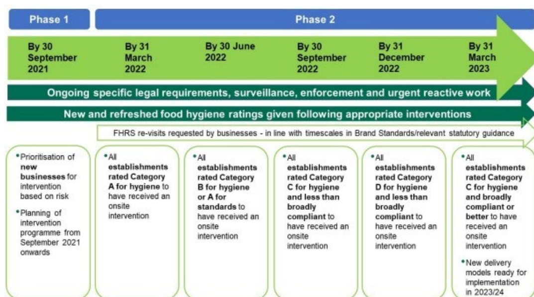
Figure 2 Recovery Plan Key Milestone Dates

Sunderland City Council's Service Delivery/FSA Recovery Plan aligned as closely as possible at each milestone with the FSA Local Authority Recovery Plan. The milestones are outlined in Figure 2 below.