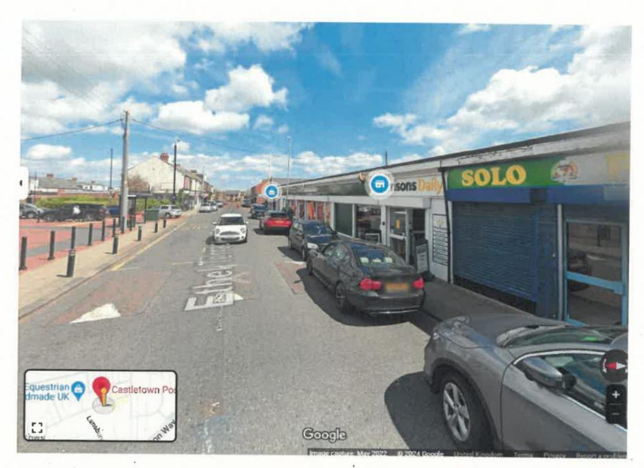
Figure 2 – Ethel Terrace (Opposite the premises)