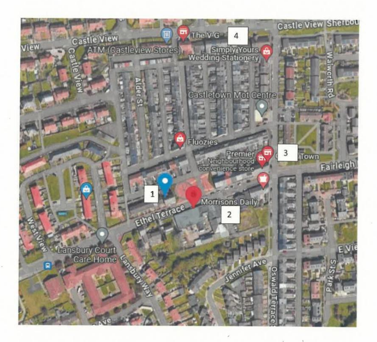
Figure 4 - Similar Premises Licences nearby