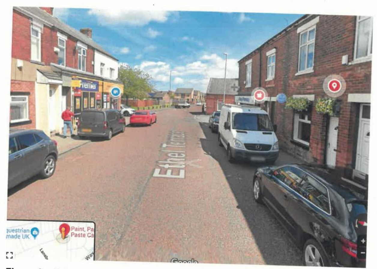
Figure 3 - Ethel Road cont