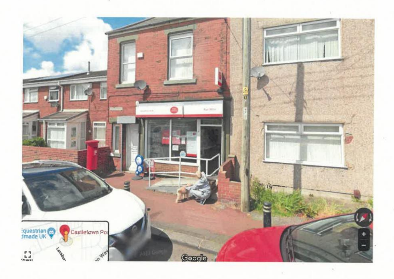
Figure 1 - Castletown Post Office