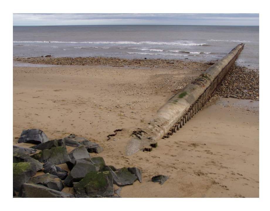
This picture 24.02.09 shows the massive amounts of sand/gravel movement happening Before the moving of the Rock Armour at Sewer Pipe for ramp works??? [Grangetown CSO]