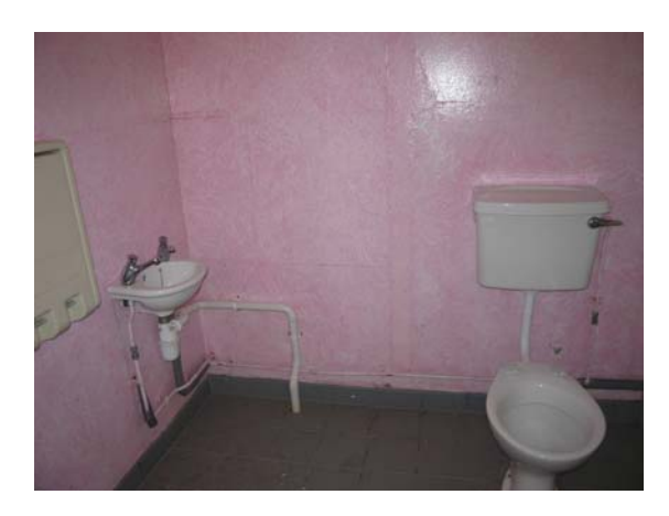
Public toilets in Seaburn Shelter