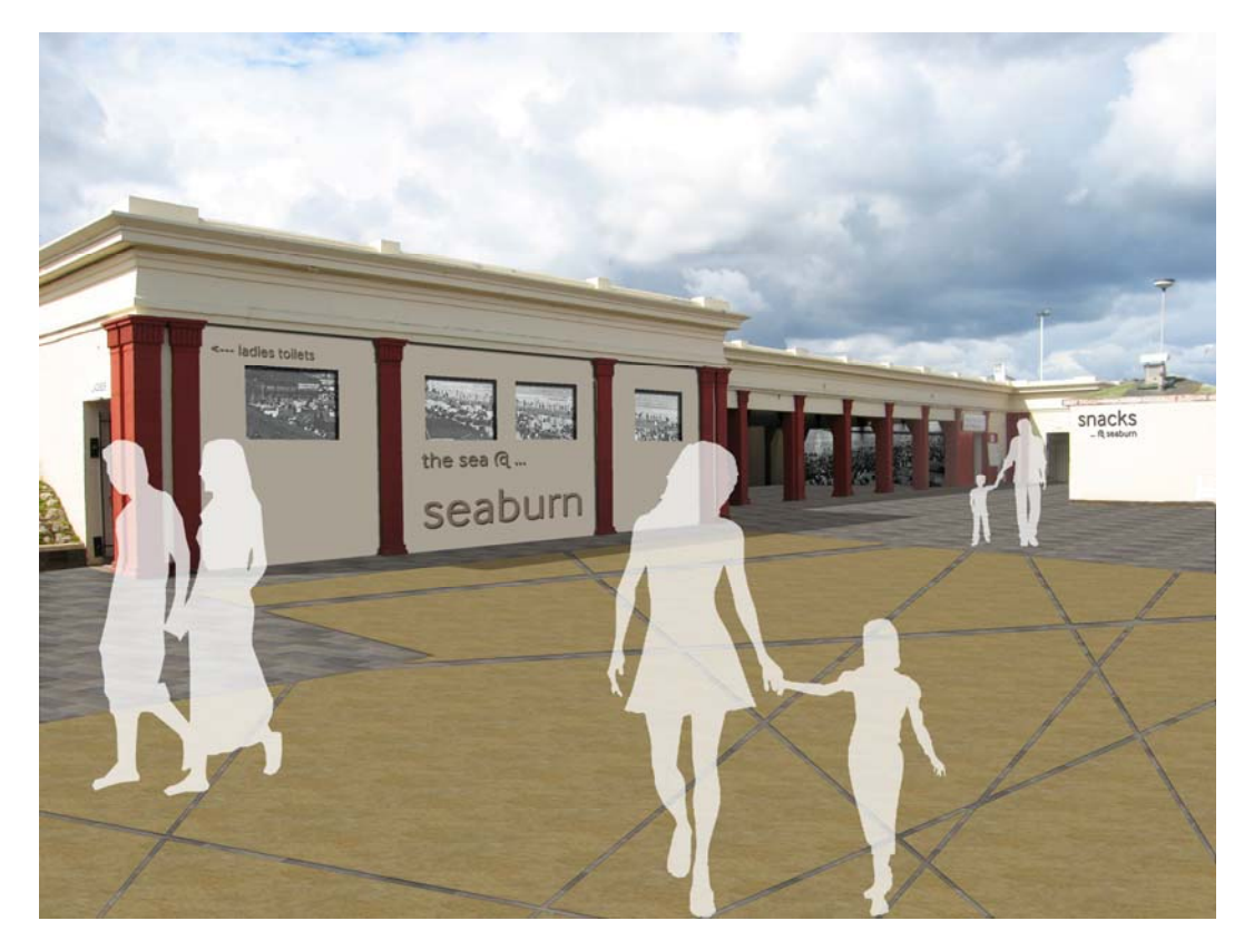
Figure 1: An example of how public realm improvements in front of Seaburn seating shelter could look

There is potential for up to £100,000 match funding from the Highways Maintenance budget to create a more pedestrian friendly and attractive crossing point between the Seaburn Centre and Seaburn shelter to complement public realm improvements in this area.