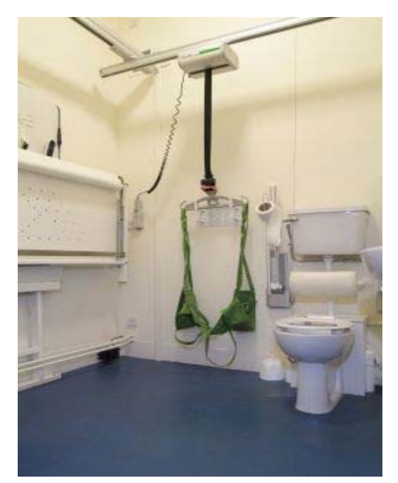
An example of 'Changing Places' facilities

Match funding is available from the council's Adult Services budget to install a 'Changing Places' facility at Seaburn as part of the toilet refurbishment.