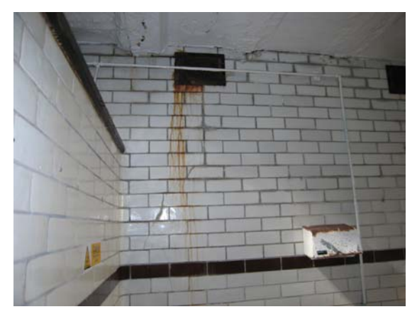
Public toilets located adjacent Seaburn Tram Shelter