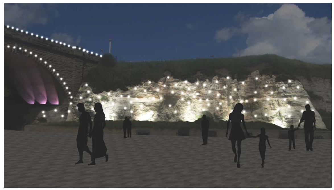
Mock up of illuminated Roker Cliff

The cost of installing feature lighting would vary depending on the number of features to be highlighted. For example lighting and landscaping to Bede's cross and the nearby seating would cost approximately £50,000.