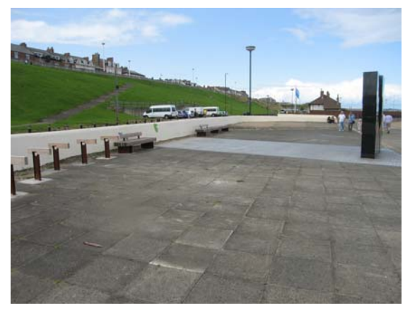
Public realm in front of Adventure Sunderland

In addition there is potential for up to \pounds 100,000 match funding from the Highways Maintenance budget to improve areas of Marine Walk designated as adopted highway.