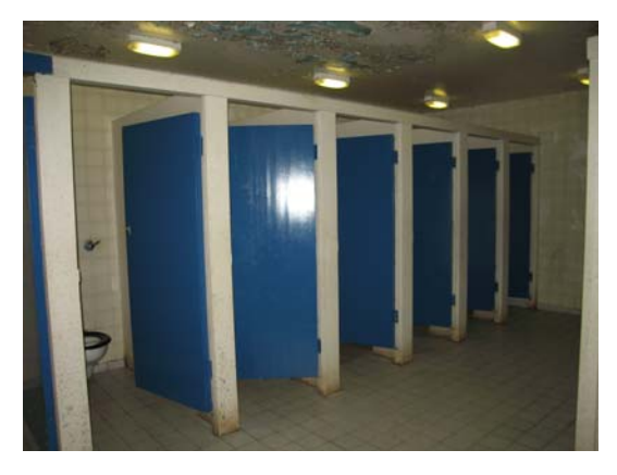
Public toilets at Cat and Dog Steps, Seaburn

The three public toilet facilities located at Seaburn are in the greatest need of refurbishment. It is estimated to refurbish these toilets will cost approximately £100,000. A further £5,000 would allow the signage to the toilets to be improved.