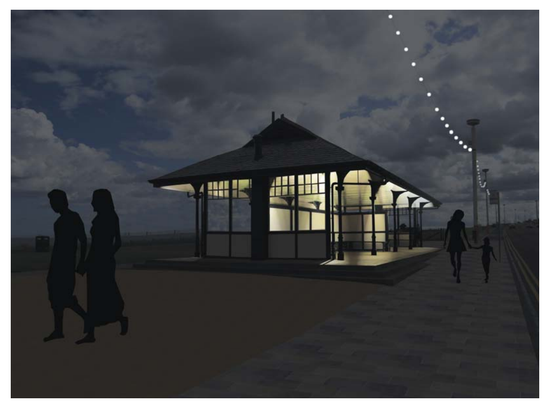
A mock up of the seating shelter lit up