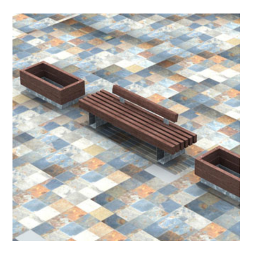
Examples of modern seating and planting tubs