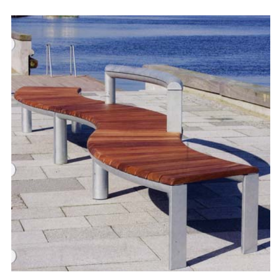
An example of modern seating

The introduction of new seats and litter bins along the lower promenade would greatly improve the appearance of the area and increase visitor satisfaction. The improvements would be highly visible and create a sense of arrival to the seafront for those approaching Seaburn from the north along Whitburn Road by car and bike.