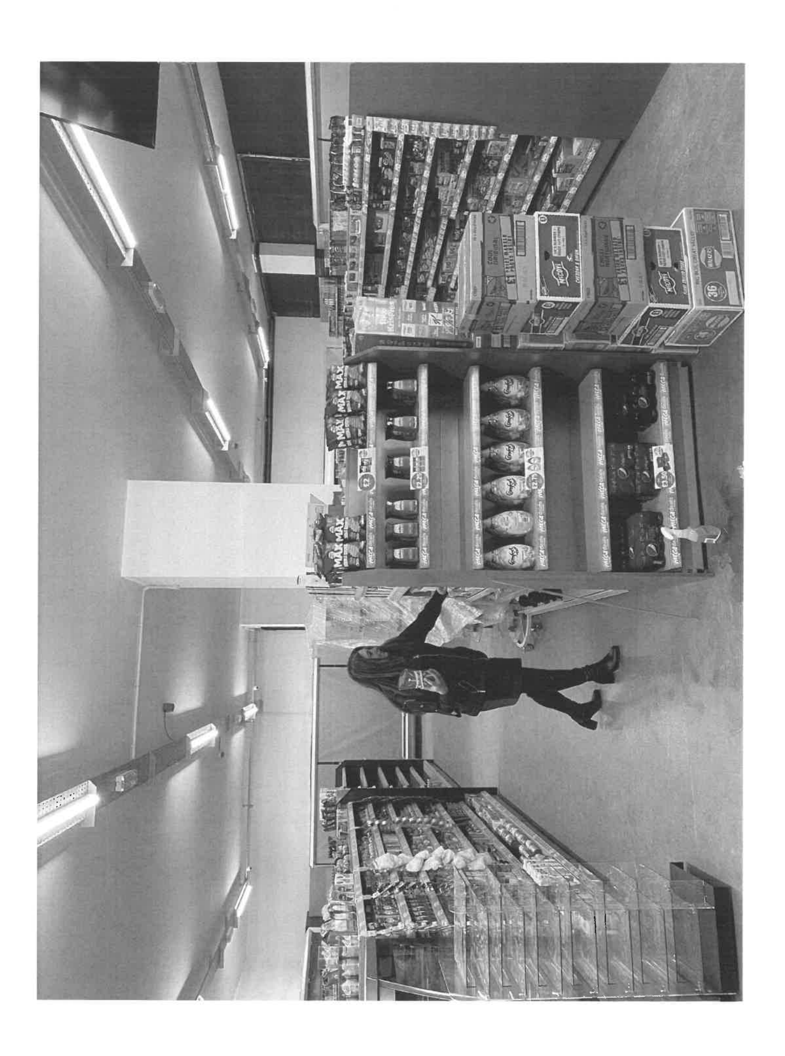
Page 44 of 46