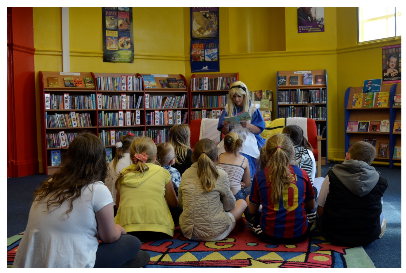
Mad Hatter's Tea Party – Community Lead event for Young People