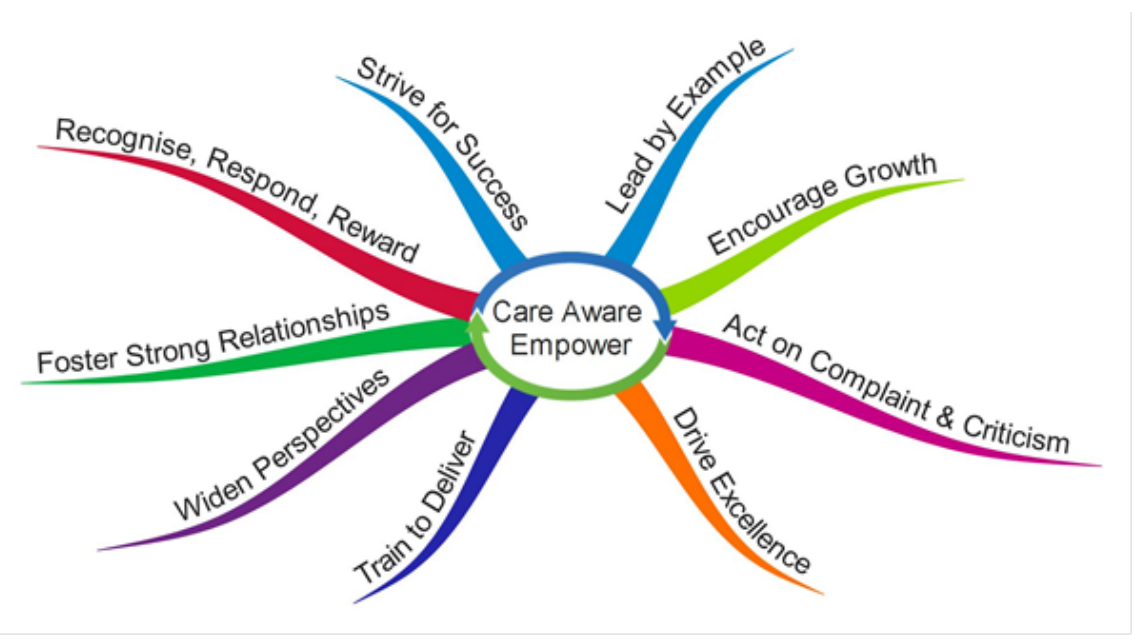
Diagram 2 – The Leadership Bond (showing the nine Leadership Behaviours and three Elements)