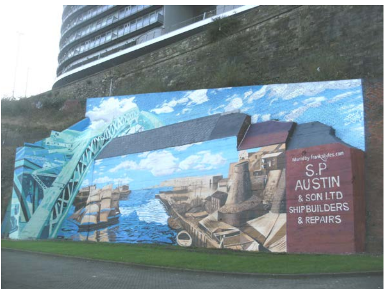
Panns Banks: Celebrating our river corridor

A mural entitled the history of the river corridor has been painted at Panns Bank. It is designed to reflect the heritage of the river wear and it is a riverside highlight of the newly opened section of the England Coast Path, a new national trail improving access to the coast. The committee have allocated funding to provide signage and art work along the route of the path that interprets stories and information about the coastline and Hendon and Ryhope communities.