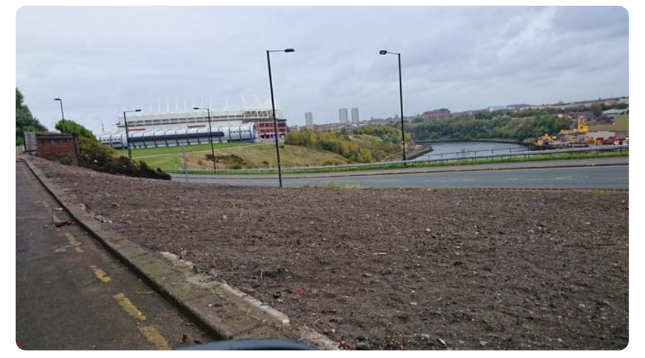
Johnstone Villas after