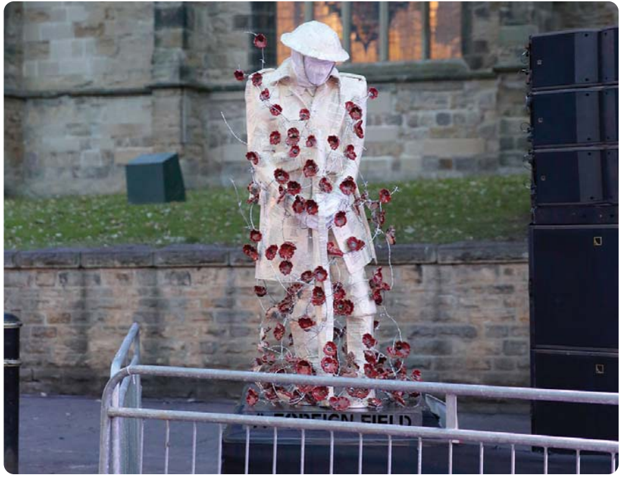
First World War Soldier

In supporting vulnerable and older people we have worked with partners to deliver: