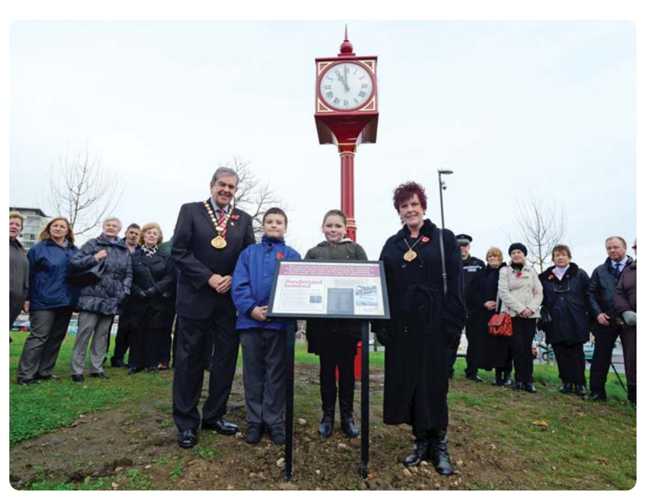
Wheatsheaf Memorial Clock

Members continue to be involved in opportunities to make best use of our heritage in the Area: