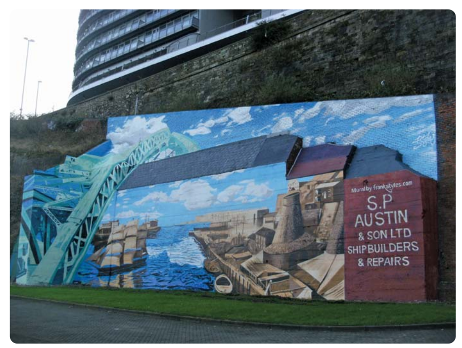
Panns Bank after

We have helped school children learn about safety at Safety works, an interactive safety centre. Partners, such as, Nexus, St John Ambulances, Northumbria Police, Gentoo and local councils, have developed realistic zones within an industrial unit to reflect different scenarios at the centre to help children to develop new life-skills