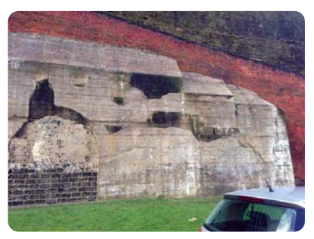
Panns Bank before

associated with mental illness in people they know, as well as their local communities, to help ensure appropriate support is close by. One of the supported projects seeks to help people affected by mental health issues by providing an opportunity to get out and about and try something new. Whilst outside, members will take photographs of the area and use the prints to host an exhibition to celebrate the area and their work.