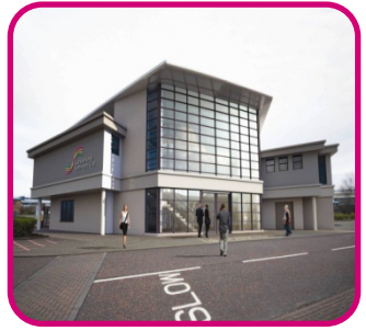
North East Business & Innovation