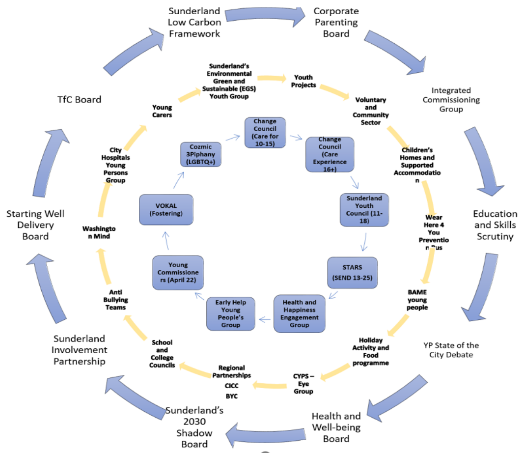
Chart 1. Existing governance arrangements

The chart shows both the groups themselves, and the agendas they consider, so for example; the EGS Youth Group feeds into the Low Carbon Board and Framework; the two Change Council groups of cared for and care experienced young people report their work, issues and concerns to the Corporate Parenting Board; and the school and college councils feed into the Youth Council itself.