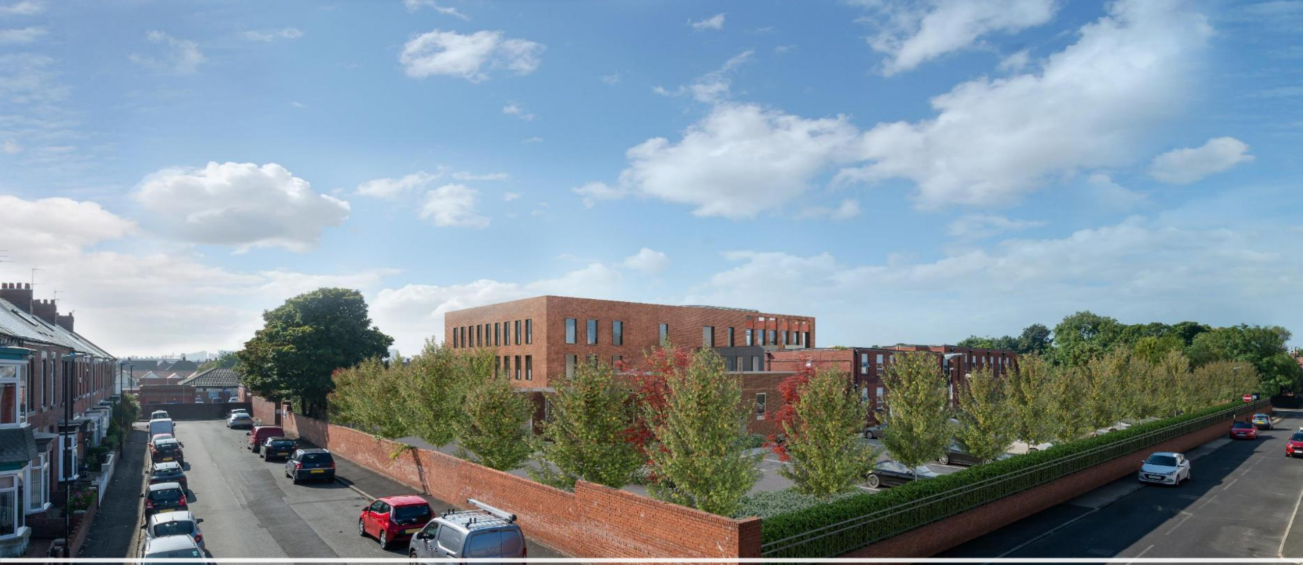
Proposed View from neighbouring street