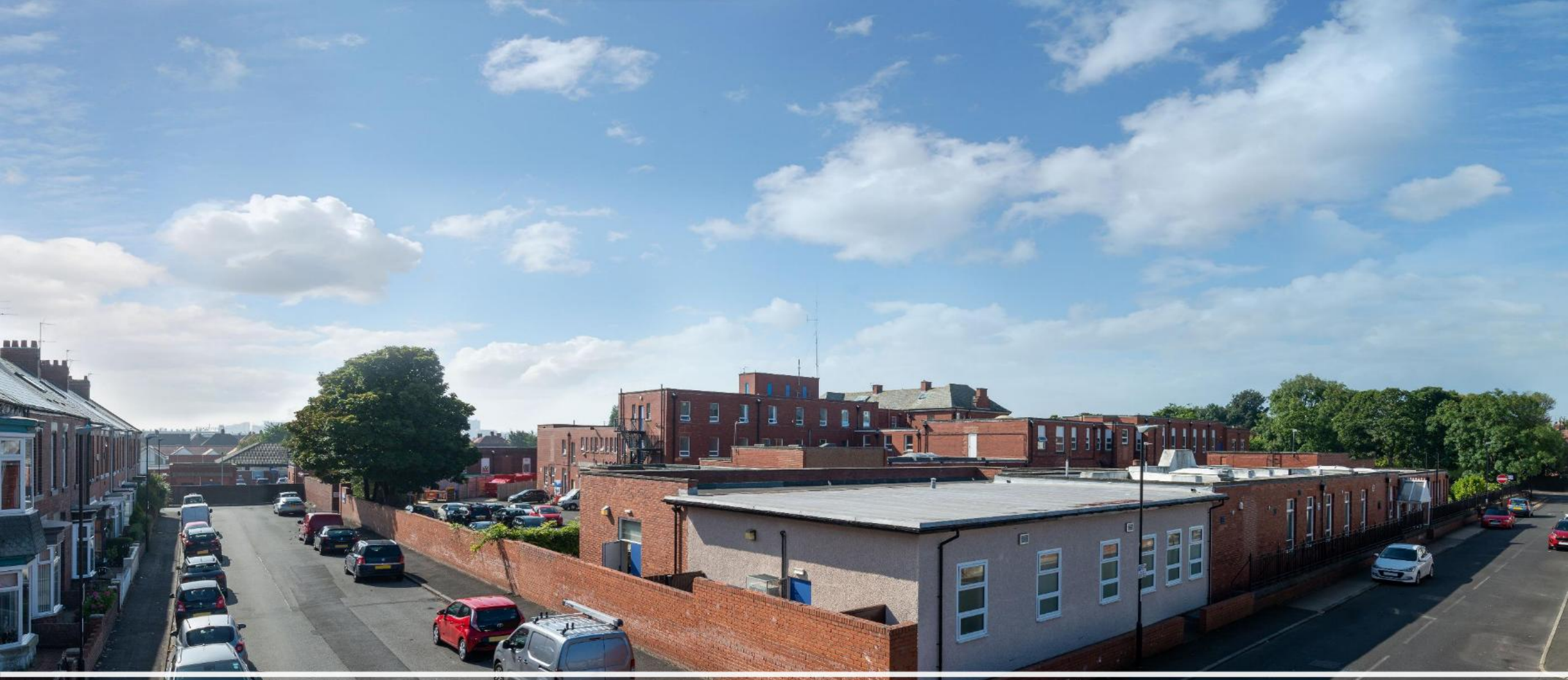
Existing View from neighbouring street