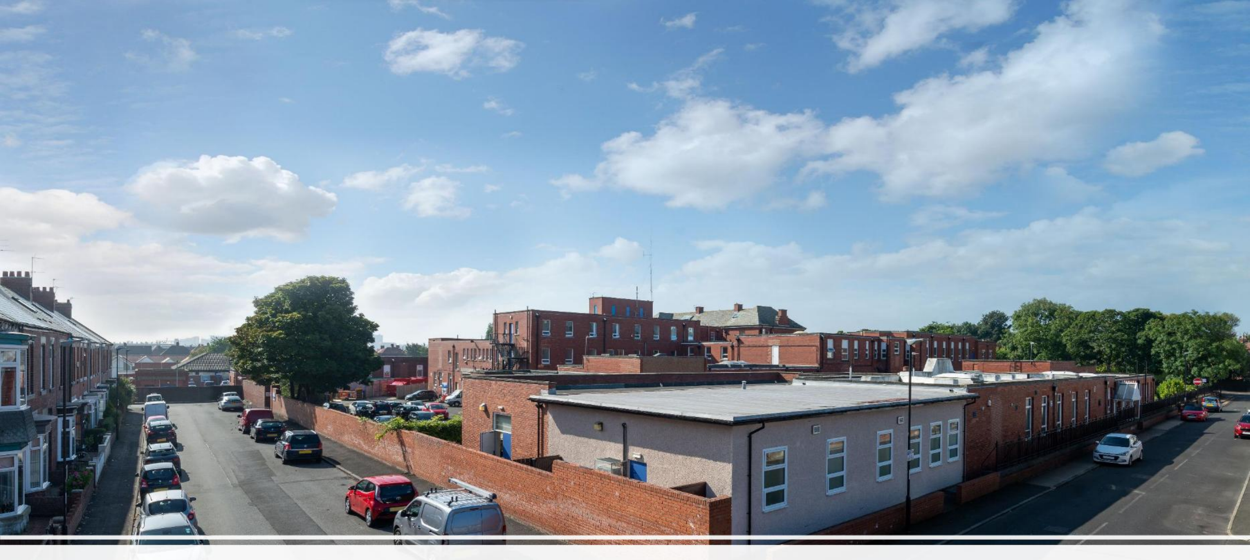
Existing View from neighbouring steet