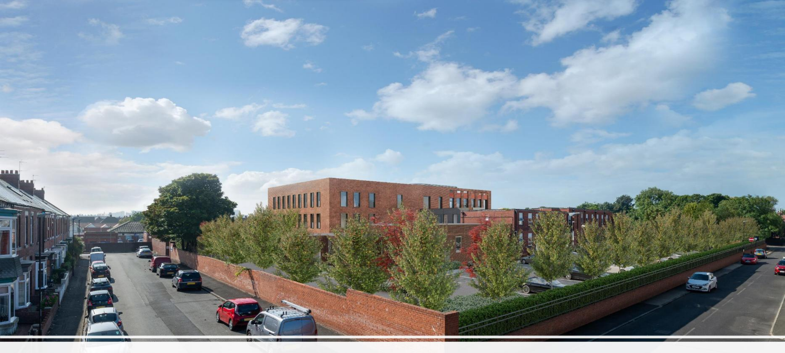
Proposed View from neighbouring street