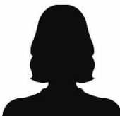
Vacant Position Associate Director of Housing