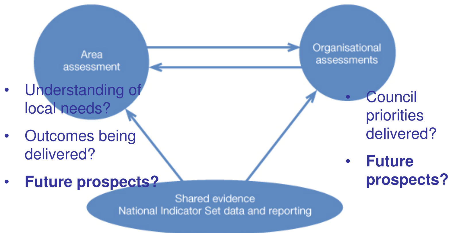
The CAA framework