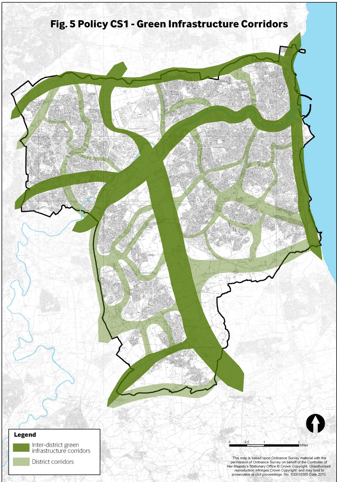
Fig. 5 Policy CS1 - Green Infrastructure Corridors