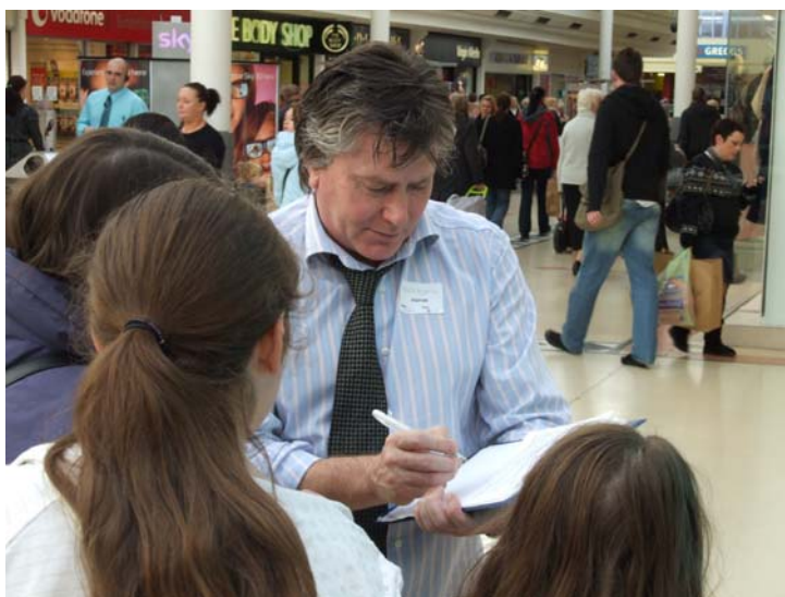
Consulting local people about how young people who offend can give back to local communities

The local and national context for youth justice sets down the strategic direction for Sunderland Youth Offending Service and it is within this context that preventing offending