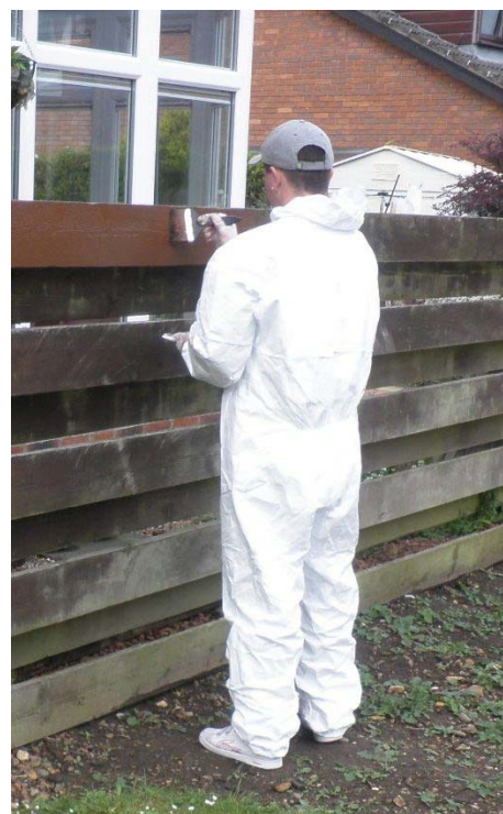
Young person makes good for their offending