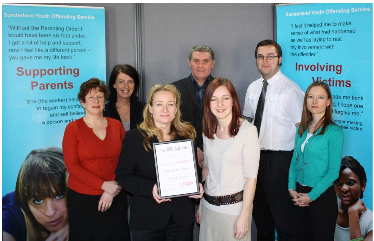
Highly Commended Management Team Local Government Chronicle Awards 2011