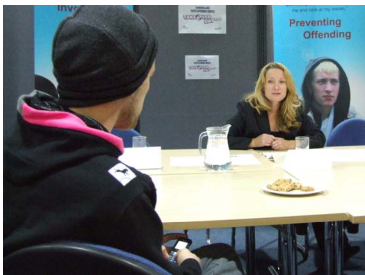
YOS Manager talks to young people about their experiences and how Sunderland Youth Offending Service can make a difference

The local and national context for youth justice sets down the strategic direction for Sunderland Youth Offending Service and it is within this context that preventing offending