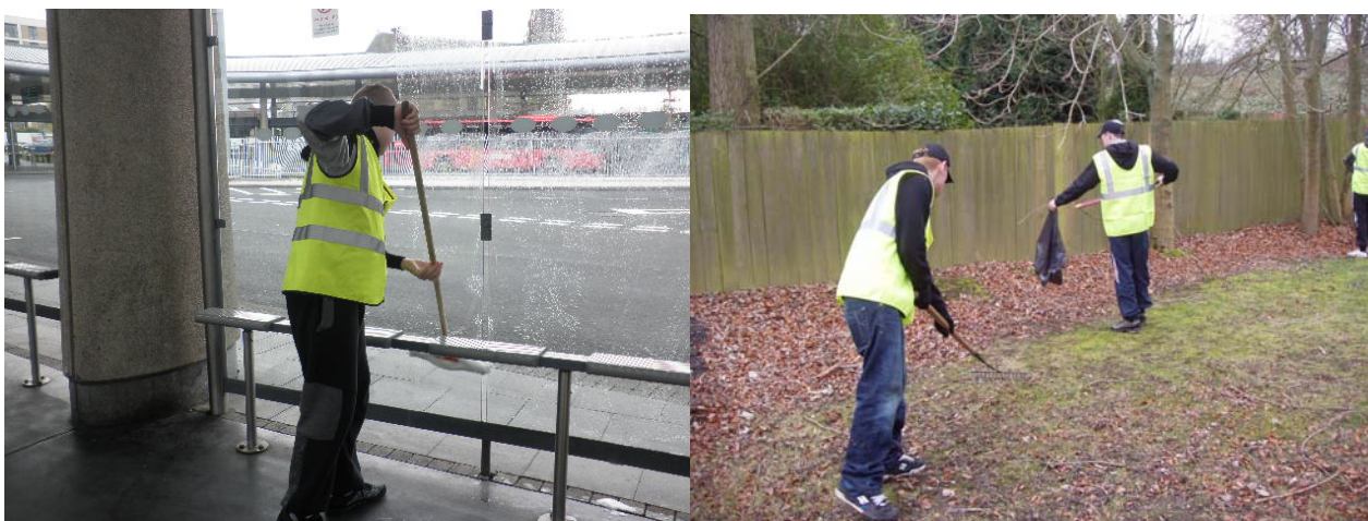
Restorative Justice Services – young people who have offended repair the costs of their offending through Community Payback

“The family intervention programme demonstrated average potential savings of £14,338 per family through the prevention of negative outcomes for hard to reach families”. The scheme cost on average less than £2000 per family.