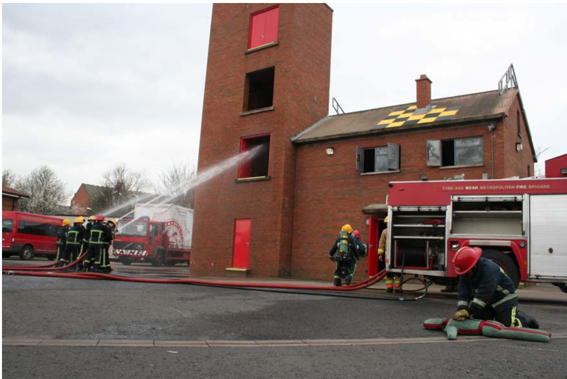
The Phoenix Programme in partnership with Tyne and Wear Fire and Brigade

Sunderland YOS has a strong partnership approach to delivering effective services evidenced in a committed and effective partnership YOS Management Board. Additional to statutory services, Sunderland YOS provides a range of specialist and award winning intervention programmes that are targeted at specific need and risk groups.