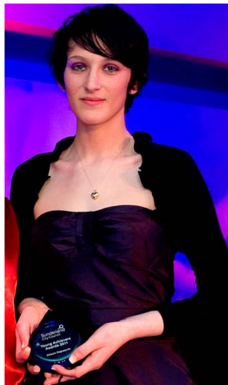
Young Achievers Awards 2011

Testimony to our success in enabling young people who offend to turn their lives around is the achievements that young people who have offended have made with the support of Sunderland Youth Offending Service, including young people winning Young Achievers Awards and Top Scorer Awards. Sunderland YOS can also demonstrate, how victims of young crime have been able to move on from offences against them, by being given a voice in how young people payback for their offending.