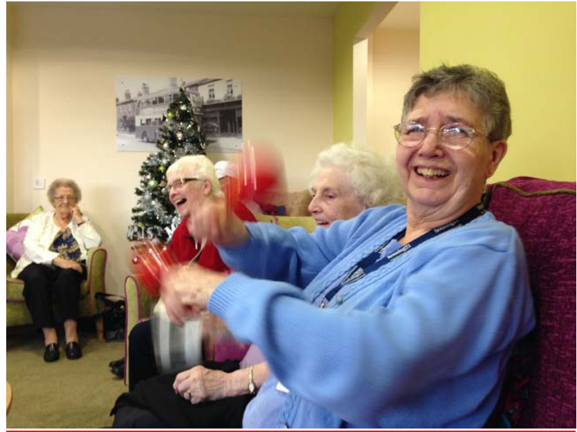
Seafarers Way: Music Workshops

We are continuing to work closely with, and support, the East Area Voluntary and Community Sector (VCS) Network. VCS organisations have been integral in supporting the Area Committee to achieve what it has during 2014 / 15 and relationships will continue to strengthen in the future as opportunities arise for our communities to become more self sufficient and resilient. We're committed to improving on the successes we have seen this year and will continue to keep local communities at the heart of everything we do. We will continue to develop our relationships with partners and identify future priorities together to ensure local services are joined up and that we are supporting local communities to take an active role in shaping services to meet local need. Area Committee members in their role as community leaders will continue to be best placed to work with local communities in collaboration with our partner organisations.