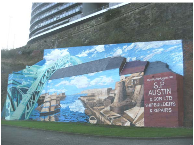
Panns Banks: Celebrating our river corridor

A mural entitled the history of the river corridor has been painted at Panns Bank. It is designed to reflect the heritage of the river wear and it is a riverside highlight of the newly opened section of the England Coast Path, a new national trail improving access to the coast. The committee have allocated funding to provide signage and art work along the route of the path that interprets stories and information about the coastline and Hendon and Ryhope communities.