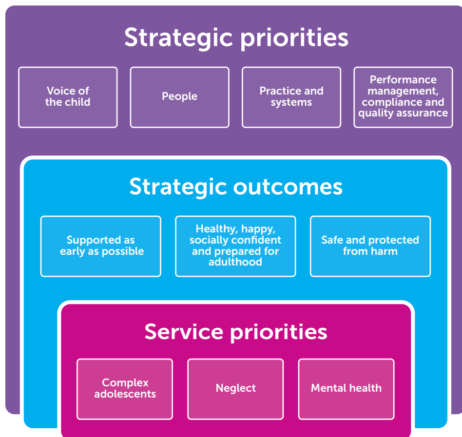
Figure 4: SSCP Priorities for 2020–21