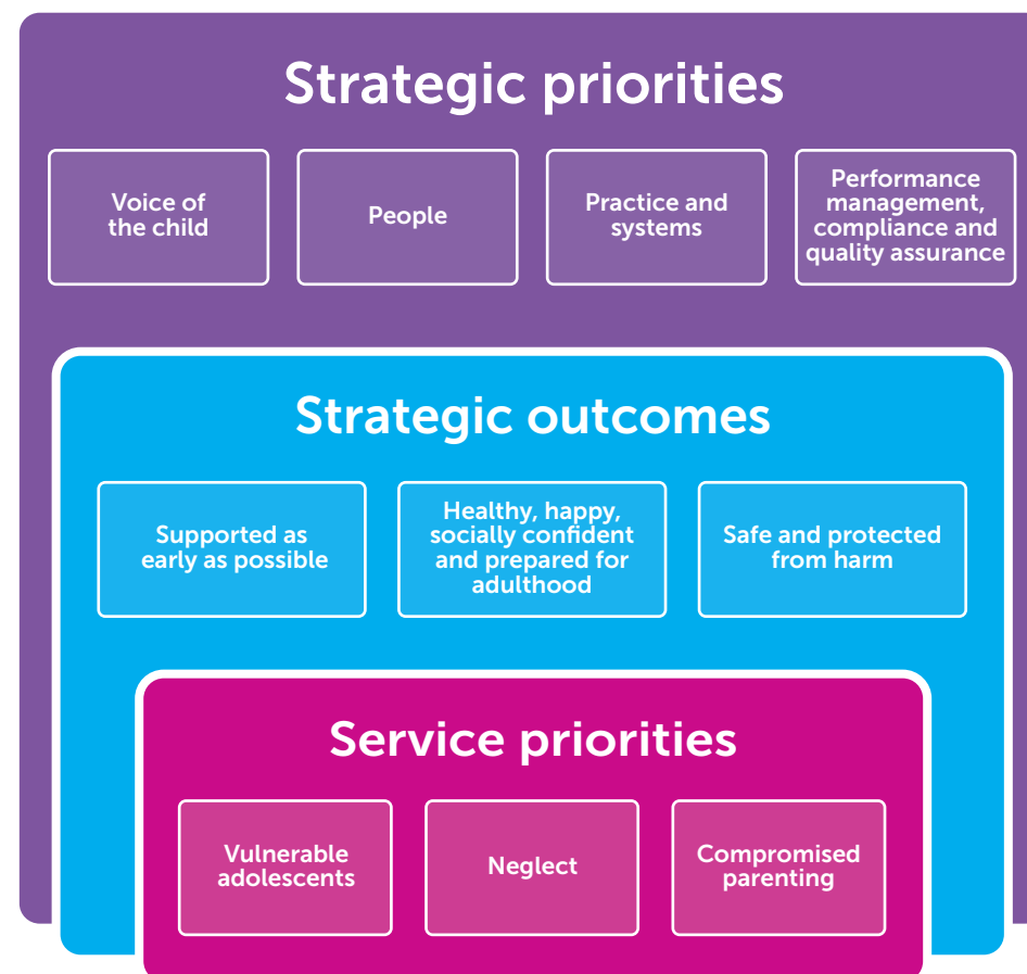
Figure 1: SSCP Priorities for 2019–20

The SSCB arrangements transitioned into the Sunderland Safeguarding Children Partnership (SSCP) in 2019. Interim arrangements and plan, covering the period September 2019–September 2020, were put in place; the plan can be found here and the Strategic Priorities for the partnership and the SSCP Structure for the same period are included in Figure 1 and Figure 2 respectively.