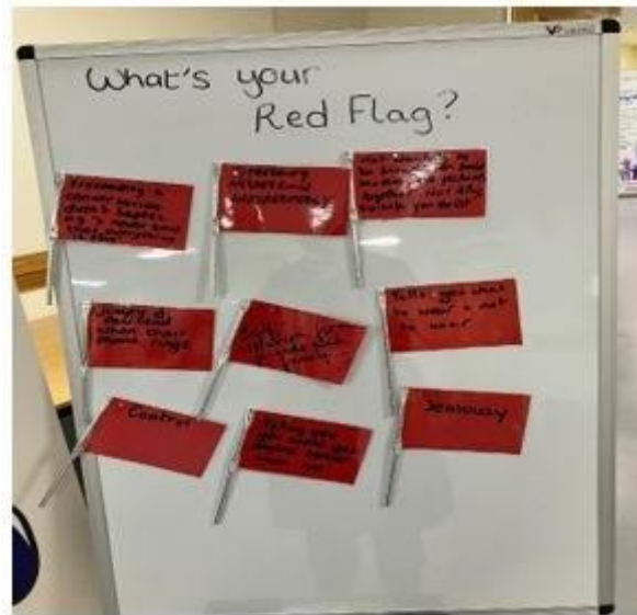
3 - What's your red flag?