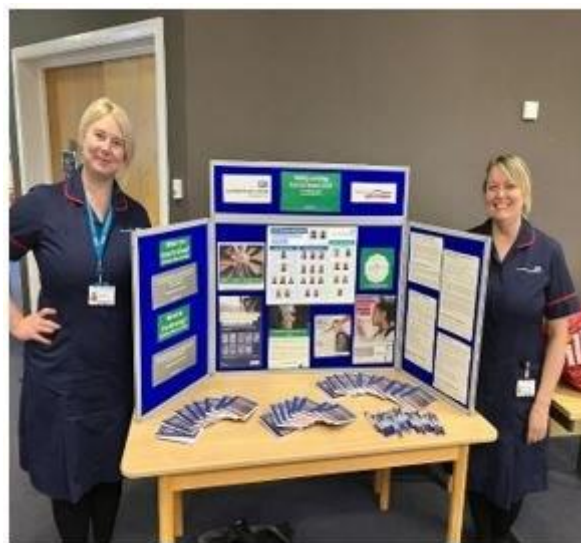
2 - STSFT's Domestic Abuse stall