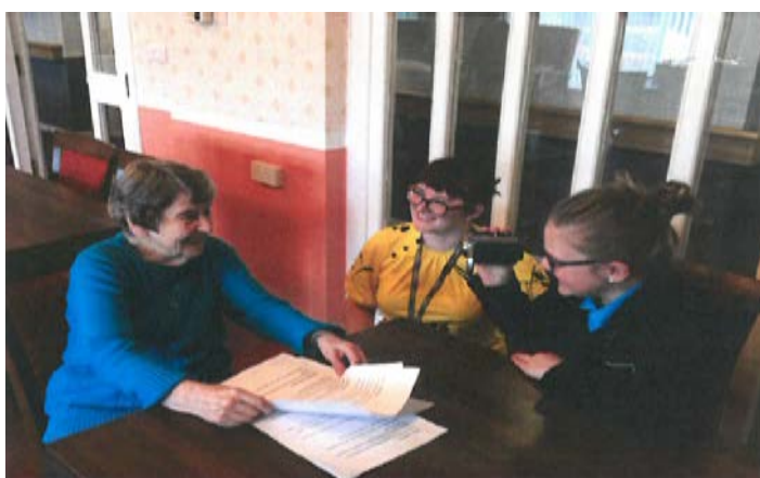
Young people and staff interviewing and filming residents

The Washington 50 Project awarded nearly £50,000 to deliver various projects to celebrate Washington New Town's 50 th birthday and to create a legacy. Performance reports were previously submitted for all but one project, which was given an extension until December 2015. Washington School which was funded £2,000 to deliver a Living Witness Project. Key progress includes a website construction, the use of Mail Chimp so that parents can receive E bulletins and an extensive marketing team worked with BBC reporters, with children interviewing. Family links were built, and life stories collated. Work was undertaken with Roseberry Court and links suggested with Washington Mind in relation to the Hub / Charter Mark and the School Opportunities project. 6 weeks of filming was undertaken with 13 residents interviewed.